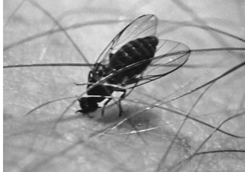
Figure 27-12a Brock Biology of Microorganisms 11/e