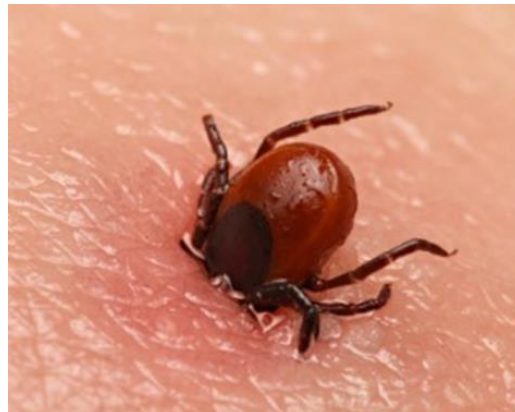
Figure 27-7 Brock Biology of Microorganisms 11/e