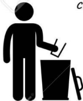
Throw away water container