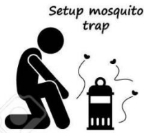
Setup mosquito trap