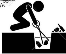
Clear clogged drain